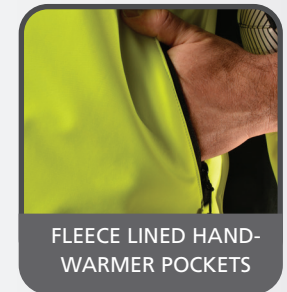
FLEECE LINED HAND- WARMER POCKETS