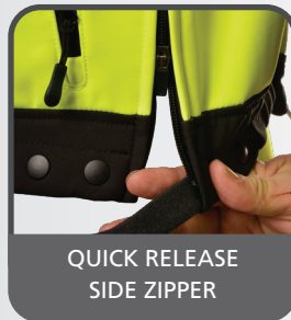
QUICK RELEASE SIDE ZIPPER