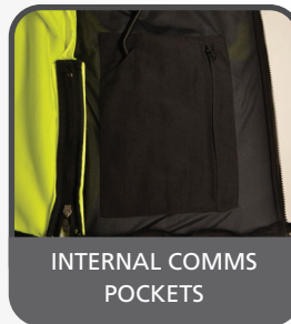
INTERNAL COMMS POCKETS