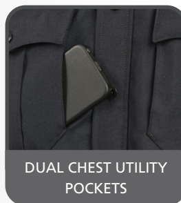
DUAL CHEST UTILITY POCKETS