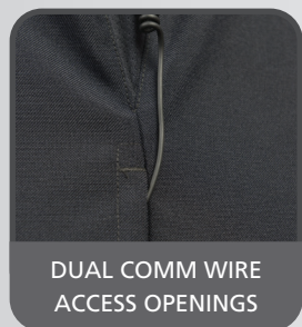
DUAL COMM WIRE ACCESS OPENINGS