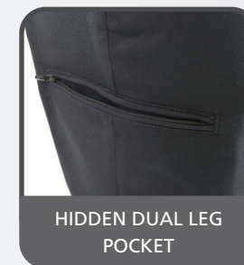
HIDDEN DUAL LEG POCKET