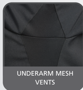
UNDERARM MESH VENTS