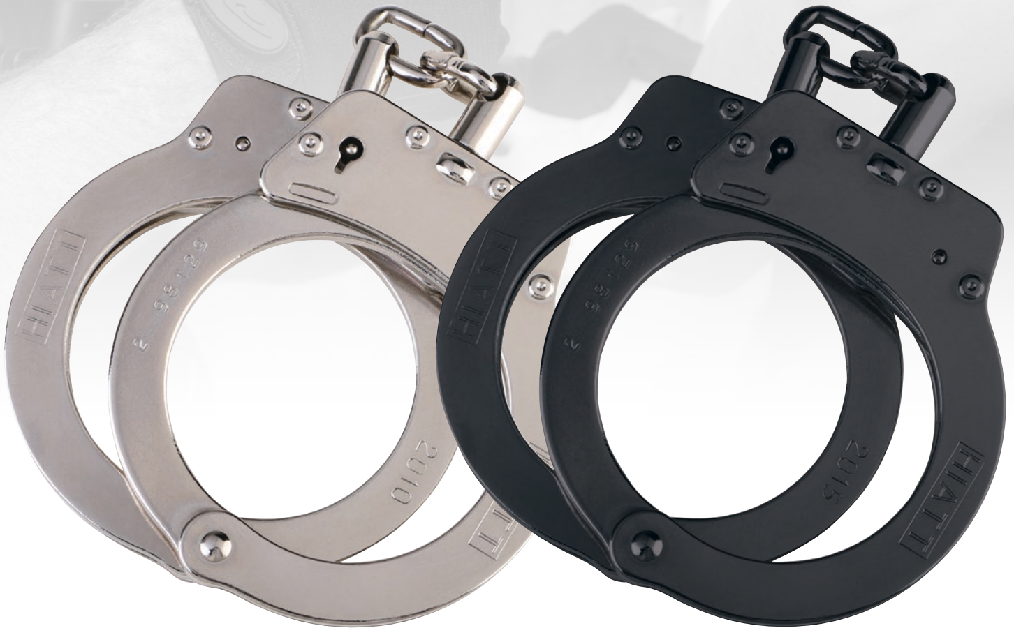
Model 2010H: Nickel Plate finish