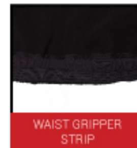
WAIST GRIPPER STRIP