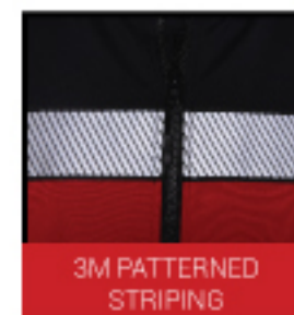
3M PATTERNED STRIPING