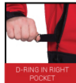
D-RING IN RIGHT POCKET