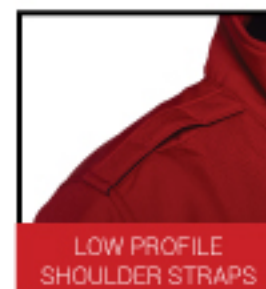
LOW PROFILE SHOULDER STRAPS