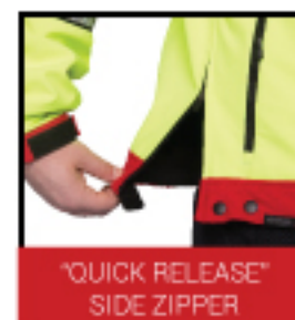
"QUICK RELEASE" SIDE ZIPPER