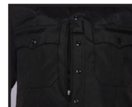
ZIPPER OPENING ON PLACKET