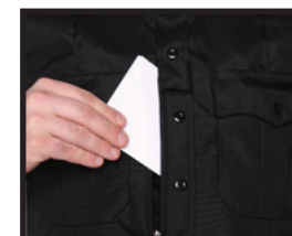
LARGE HIDDEN DOCUMENT