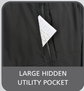
LARGE HIDDEN UTILITY POCKET