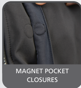
MAGNET POCKET CLOSURES