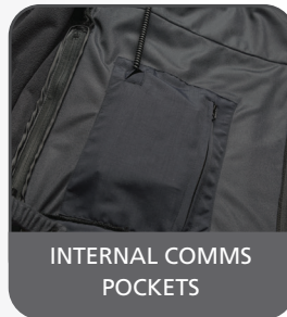
INTERNAL COMMS POCKETS