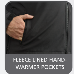
FLEECE LINED HAND- WARMER POCKETS