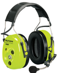
Hi-Viz cup color *Must be used with FL6007-WS-GB